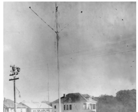
Tall antenna at Federal Telegraph Company, 913 Emerson Street, 1912

Lee de Forest's 1957 autobiography is entitled "Father of Radio." In 1958, at age 83, he visited Palo Alto and was photographed admiring the "father of radio" metal sign. In 1960, Lee received an honorary Academy Award for lifetime achievement. He died in 1961 in Hollywood, leaving a bank account of $1,250.