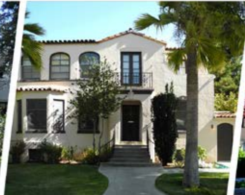
745 Waverley Street