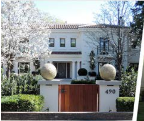
490 Kingsley Avenue