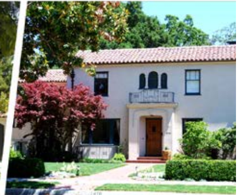
470 Coleridge Avenue

Palo Alto Stanford Heritage (PAST), in cooperation with the Palo Alto Historical Association (PAHA), will host its 28th presentation of Centennial Plaques to owners of circa 1923 buildings in Palo Alto. This event was started in 1994 by the City of Palo Alto's Historic Resources Board as part of Palo Alto's Centennial celebration. The Plaques were presented to owners of buildings built in 1894 or earlier. In 1996, PAST decided to carry on the tradition by recognizing buildings built in 1895 and 1896. That year, the organization also presented its first Preservation Awards to recognize preservation projects that renovate, rehabilitate, or restore local historic buildings.