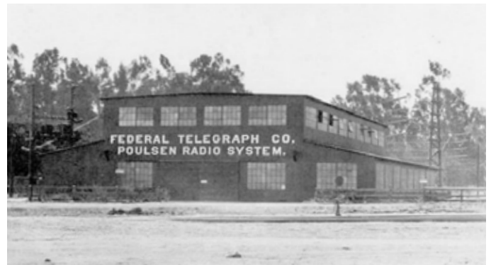
Federal Telegraph Company factory on El Camno Real, 1920

At the start of the war, the Navy Department asked the U.S. Congress for funds to purchase all of Federal Telegraph's transmitter stations and patents. The request was denied; however, the Navy then found the money needed to make the purchase on its own.