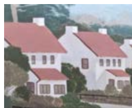
"Presidio Row"