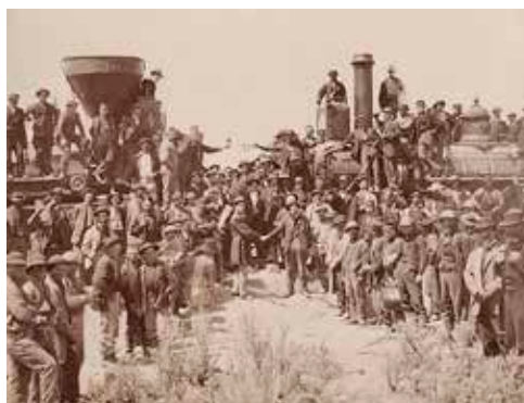
A.J. Russell image "Last Spike" - May 10, 1869

Celebrations of the 150th anniversary of the Transcontinental Railroad are continuing at various local locations. The Oakland Museum features an exhibit Pushing West: The Photography of Andrew J. Russell (through September 1), 1000 Oak Street, Oakland www.museumca.org . The California Historical Society presents two concurrent exhibits— Westward the Course of Empire and Overland to California (through September 8), 678 Mission Street, San Francisco www.californiahistoricalsociety.org .