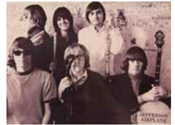
Jefferson Airplane, 1967

El Palo Alto Room Mitchell Park Community Center 3700 Middlefield Road, Palo Alto