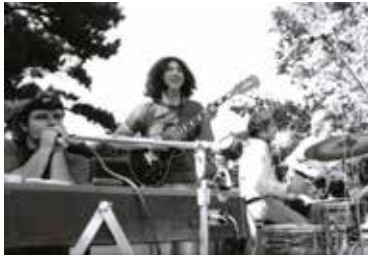
Grateful Dead, El Camino Park, 1967