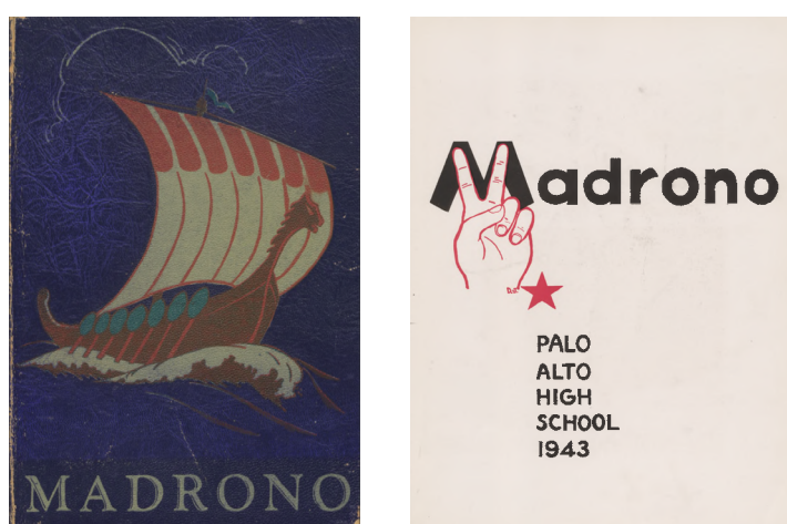
An early Viking motif on the 1934 cover of the Madrono yearbook. Paly adopted the Viking as a mascot in 1938. After the US entered the Second World War, the yearbook portrayed a patriotic and hopeful mood on campus.