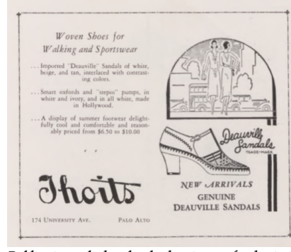
Publications relied on local advertisers to fund printing, such as Thoits Shoes (1909) and The North Face (1970).