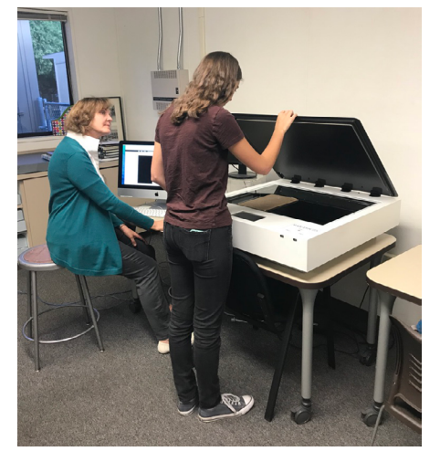
The archiving team uses an extra-wide scanner to digitize full versions of Paly newspapers and yearbooks, such as the early 1960s Madronos below.