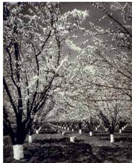
A blooming orchard in Palo Alto, 1948.