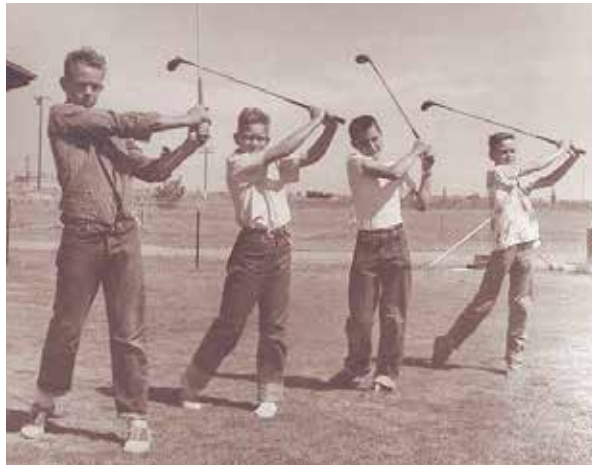
A group golf lesson at Palo Alto Municipal Golf Course, 1957