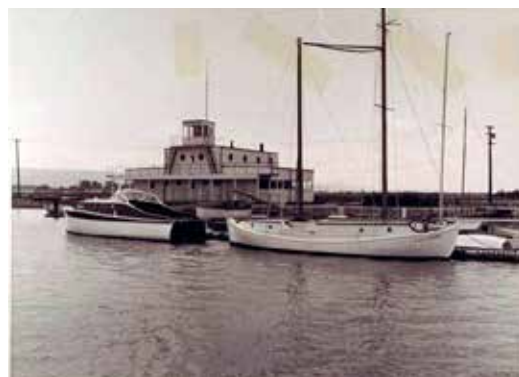
Sea Scout Base, Palo Alto baylands, 1941

And PAHA programs, are for me, a “history” I enjoy learning, and being part of. See you there! Our History, our PAHA, let’s keep it going!