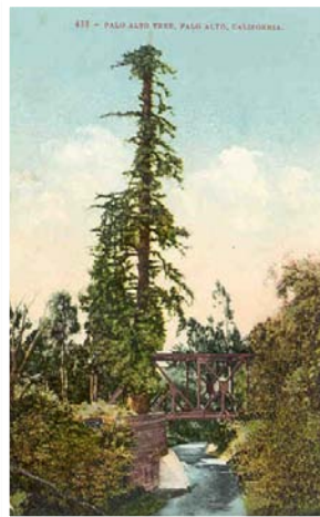
Tall Tree postcard acquired on eBay.

We will continue to acquire pieces of Palo Alto's past, often at reasonable prices. To help, please do not bid independently, by which you may compete against us. Instead, consider making a donation to the Association to fund these acquisitions, and we will keep you informed about our progress.