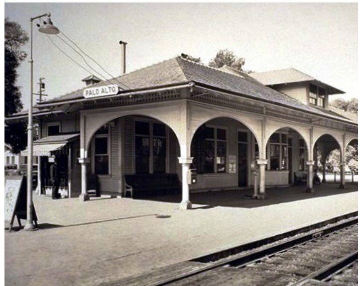
Palo Alto depot in 1930s, complete with shoeshine stand.