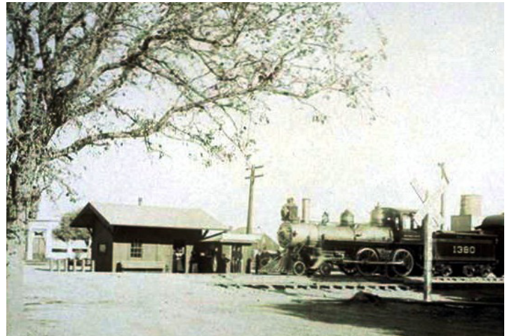
Train station in 1895, a shed-like Depot.