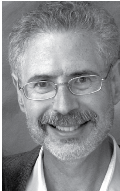
SPEAKER: Steve Blank, Entrepreneur & University Faculty Member

One year ago Steve Blank was our November speaker and vividly recalled the vital work of MIT scientists and engineers as well as others during World War II in the Atlantic and European theaters of action in defeating the Axis. Steve returns this November to remind us of those war years and how they set the stage for the creation and explosive growth of Silicon Valley. He then goes on to describe the role of Frederick Terman and Stanford in working with government agencies, including the CIA and the National Security Agency (NSA), to set up "black" (top secret) companies in Silicon Valley which, in turn, sparked the creation of many hundreds of other enterprises.