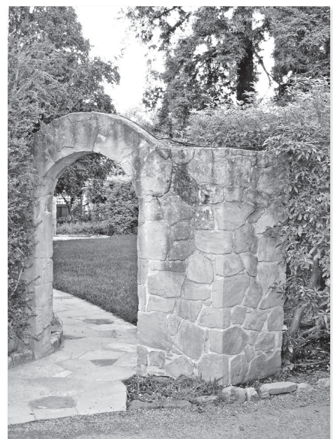
The garden gate to the 100 year old Williams House, now home to the Museum of American Heritage.