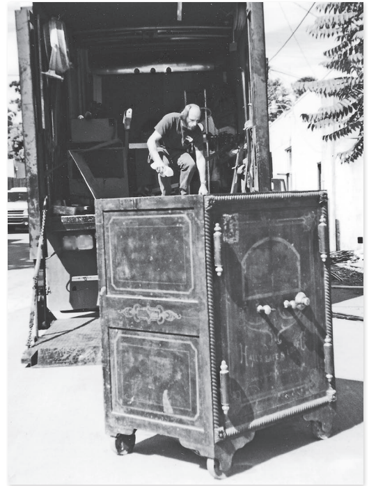
Security Safe Company moving the PAHA bank safe from the Palo Alto Medical Foundation's warehouse storage in 1997.

If anyone knows of free, secure, dry storage space, please call the PAHA Board at (650) 326-3355. We really do need the Palo Alto History Museum. —Beth Bunnenberg