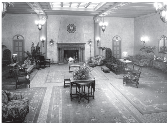
The Cardinal Hotel as it was in 1924. The hotel was the location of last month's 60 Over 50 event celebrating local businesses. The lobby is restored in keeping with its former appearance.